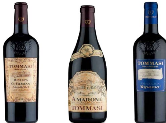
CA' FLORIAN AMARONE DELLA VALPOLICELLA CLASSICO RISERVA DENOMINAZIONE DI ORIGINE CONTROLLATA